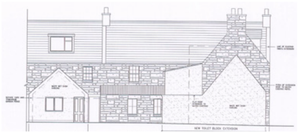
Fig. 6: Approved rear elevation (CNPA ref. no. 08/147/CP and 08/148/CP)

previously approved in 2008, where the new extension was proposed solely to accommodate new toilet facilities. A smaller area of the proposed extension would now be utilised to create improved toilet facilities, while the majority of the extension would form part of the enlarged bar area.