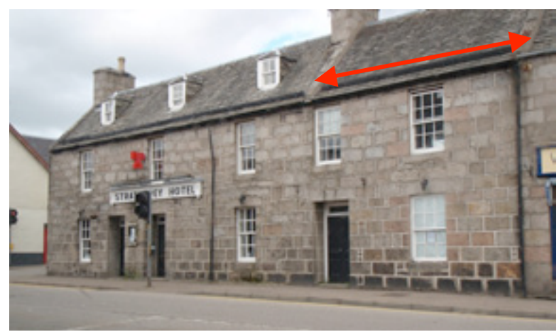
Fig. 3 : High Street elevation (red arrow identifies the area for conversion to dwelling house)

was intended to clearly mark the distinction between it and the original hotel. The approved single storey extension included a slate pitched roof on the side elevation and a lean to type roof on the rear elevation, similar to another extension already in place. The internal arrangement in the new extension was to accommodate new toilet facilities.