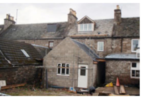
Fig. 5: Works on townhouse element

12. As the Strathspey Hotel is a Category B listed building, Listed Building Consent has also been sought for the elements of the works which would affect the structure i.e. the erection of the single storey extension from the existing building gable wall. It is stated that this is required in order to retain the hotel bar floor area lost by the demolition of the 1960's flat roof extension. The internal arrangement would therefore differ from that