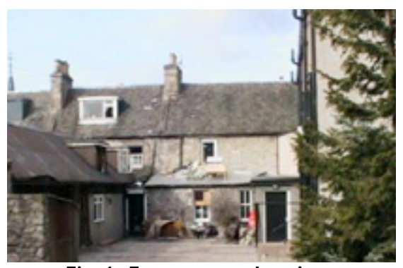
Fig. 4: Former rear elevation

Phase 7 – undertaking of final landscaping.