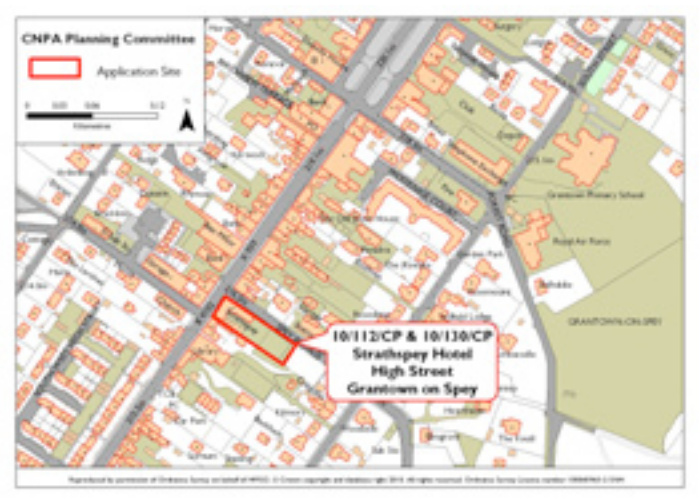
Fig. I - Location Plan