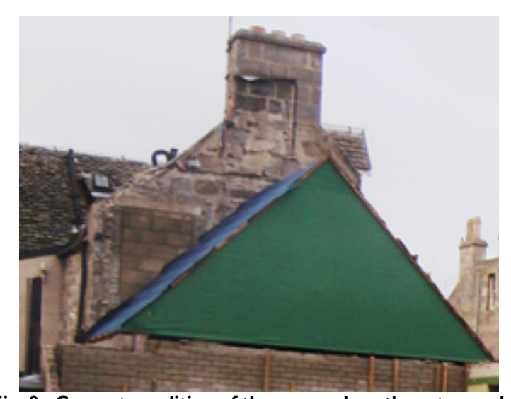
Fig. 8 : Current condition of the exposed south eastern gable

exposed stone visible on the remainder of the listed building. However, the demolition of the flat roof extension revealed that the stonework has been damaged in several places and is in poor condition, with part of it having been replaced at some time in the past by concrete blocks. It is now proposed to apply a white wet dash harl to the gable. This has been considered by Historic Scotland and while advising that this approach should be avoided if possible, it is nonetheless advised in the consultation response that if the condition of the exposed stonework is such that render is the only practical solution, a lime based render should be used. Other than discussing this point, Historic Scotland does not object to the proposal and accepts that planning permission and Listed Building Consent has previously been granted on the site.